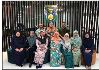
Dry run 14 Feb 2024, UBD Library