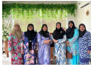
Tahlil, Doa Selamat & Meeting, 20 Feb 2024, Resto ANZ and SKF Gardens

Registration is open for members to join BLA Library Study Visit to Kota Kinabalu