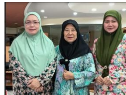
Prep Meeting 12 Feb 2024. C64 Library