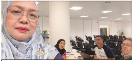
17 Feb 2024 drafting committee, UBD Library