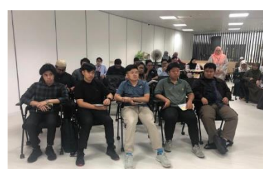
IBTE ILS08 Students, SSR Campus