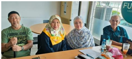
BLA Campus Meeting, 24 Jan 2024, Gadong Food Court