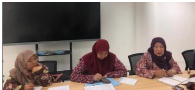
Prep Meeting, 14 Feb, UBD Library