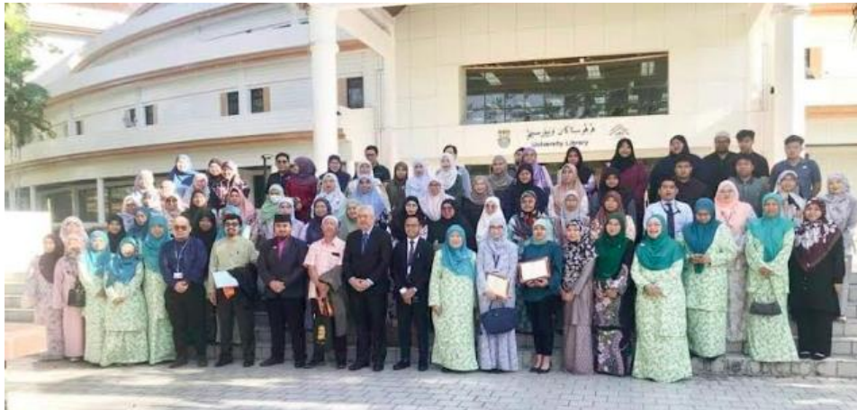
The Brunei Darussalam Library Association (BLA) in collaboration with Universiti Brunei Darussalam Library organised a one day seminar on Brunei Digital Libraries: Where are we now? to coincide with BLA 38th anniversary.