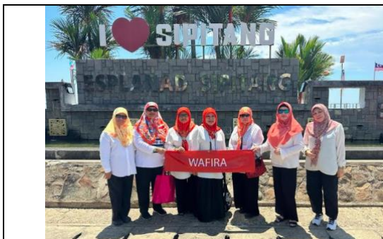
On Wednesday 6 September 2023, eight Wafira members enjoyed a day trip to the Sipitang Tamu in Sabah in search of local fruits where plentiful durians were in season