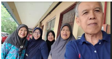
The group met on 5 Sept 2023